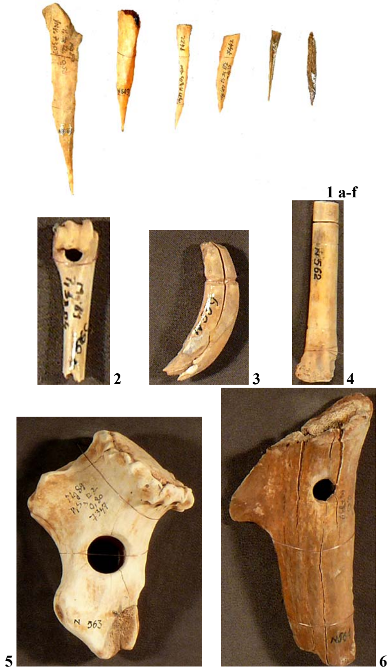
Pl. III. Bone, antler and teeth-bone objects. Tei Culture: 1-6 Mogoșești. Different scales.